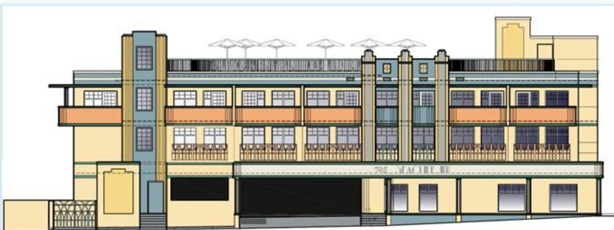
Front view of proposed hotel for 270 North Avenue

When county savings for the downtown Seacliff beautification project was reassigned to complete Phase One of the Aptos Village project, residents were not expecting any new commercial development here for the near future. This project will bring much needed improvements to North Avenue and Broadway downtown. The lot at the corner of Broadway and Center has a new owner who is exploring development opportunities we hope to report next year.