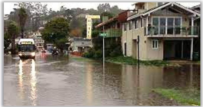
Flooding from previous storms in Rio Del Mar.

In recent years, our County experienced significant storm damage we are still working to repair. If we have a similar winter we can expect additional flooding, mudslides, road damage, downed trees, and power outages. As we experienced previously, this means that some neighborhoods might have limited access or even be cut off from access for a period of time. In advance of this season Public Works is cleaning culverts, mowing, and clearing brush in an attempt to reduce flooding potential. Call them at 454-2160 if you know of any culverts that need inspection or repair, or brush that needs to be cleared. Residents can also download the free County mobile app - My Santa Cruz County, via the County's website at: https://cconnect.santacruzcounty.us/ to report non-emergency issues. Additionally, Public Works is also asking residents to rake, if it is safe, and clean storm drains to help prevent flooding. This simple task can significantly improve drainage. If there is a more immediate need to address a road hazard, call the 24-hour Public Works dispatch number at 477-3999, option 1. If it is an emergency situation, please call 9-1-1.