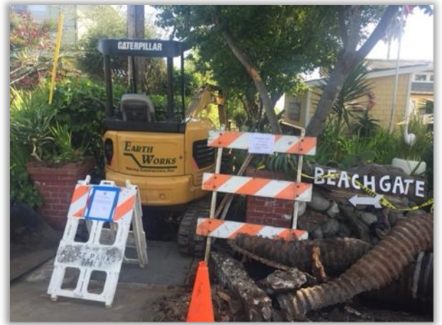
Thanks to action from the association and State Park staff, the 2019 repair of the Beachgate drainage and trail was celebrated by Seacliff residents.

Moosehead Trail - Before the recent rains this month, Peter Smithy and Dave Somerton spent an hour and a half trimming brush and weed whacking the Moosehead trail. Narrowing of this trail section near the short stairs is increasing due to burrowing rodents and erosion so this area and the rest of the trail will be evaluated after the current weather events have passed to determine what repairs will be required next year.