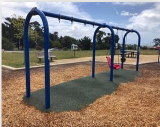
Swing set now needs two new swings

Santa Cruz County Park Friends, 870 17th Ave, Santa Cruz, CA 95062