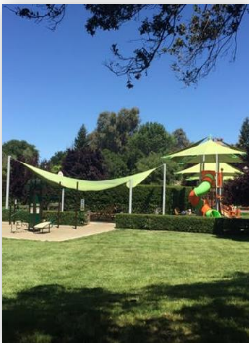
Example of Tented Shading in Park

This year, our lighthouse-themed Seacliff Village Neighborhood Park at the corner of Sea Ridge Drive and McGregor Road celebrates its fourth year of playground fun.