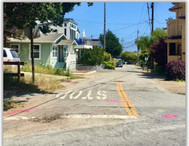
Hillcrest Drive at Mar Vista Drive is marked for Measure D resurfacing this summer.

If you have a pothole or non-emergency road issue you can submit service requests through the County's free mobile app, My Santa Cruz County, available on the app store or Google Play, online via the Public Works Department's website: https://dpw.co.santa-cruz.ca.us/Home.aspx or by calling 454-2160. As always, if you have any questions about this or any other issue, please feel free to contact me at 454-2200.