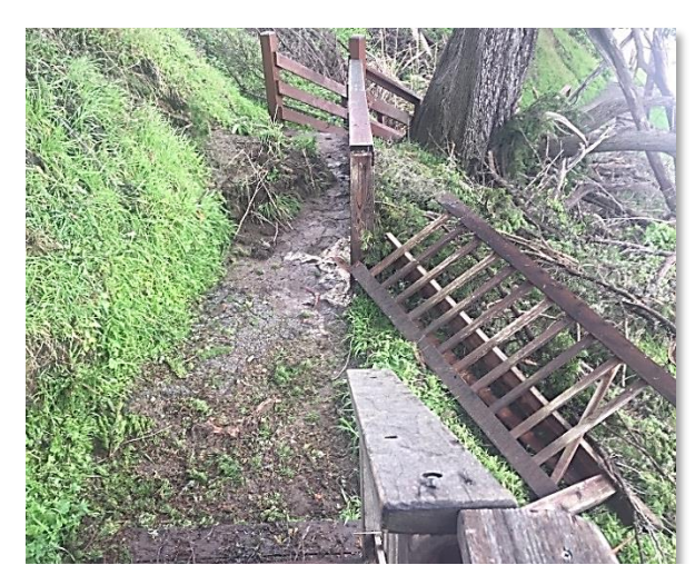
Use caution when navigating through trail damage!

If you have experience writing grant proposals, working on fundraisers and fundraising events, we could use your help. Please contact us at: <a href="mailto:info@seacliffimprovement.org">info@seacliffimprovement.org</a>