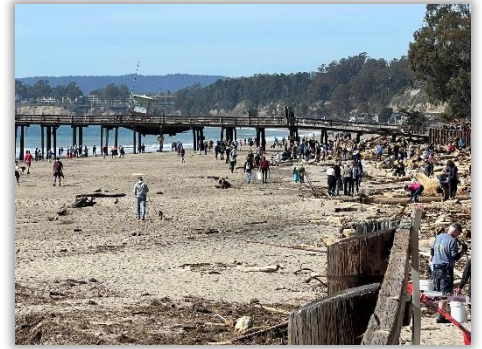
Seacliff Beach pier party and beach clean up

By the time this newsletter reaches you, our beloved pier may be gone. We learned last month that the storm destruction was too extensive to save the rest of the structure and engineers determined that it is “in a state of imminent collapse” so plans were made to deconstruct it safely and as soon as possible.