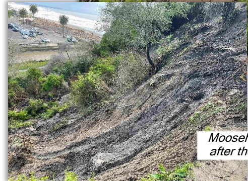
Moosehead Trail after the storms.