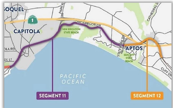
Monterey Bay Scenic Sanctuary Trail through Seacliff