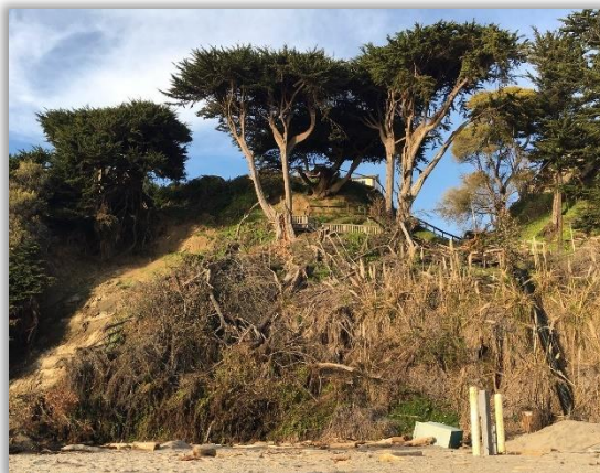
Slide with tree damage along the Middle Beachgate Trail.

The Beachgate Trail has been our family's neighbor for 24 years, requiring previous slide repairs including the area below the top set of stairs in June 2011 and the installation of a completely new storm drain and trail remodel from a January 2017 slide and sink hole that closed the trail for several months.