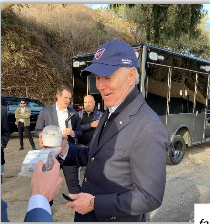
President Biden with his favorite flavor from Marianne’s!

State Parks held a pier “going away” beach clean-up event on February 18 th that was attended by more than 400 volunteers who shared fond pier memories with each other as they said goodbyes to one of our community’s icons. Our other local icon, the SS Palo Alto cement ship, still provides habitat for birds and sea life as it slowly continues its own journey to the seabed.