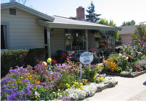
214 El Camino Del Mar

The beautification committee selected the second round of winners in August. By the time you get this newsletter, the summer color may be dwindling, but the photos show what these lovely homes looked like at their peak!