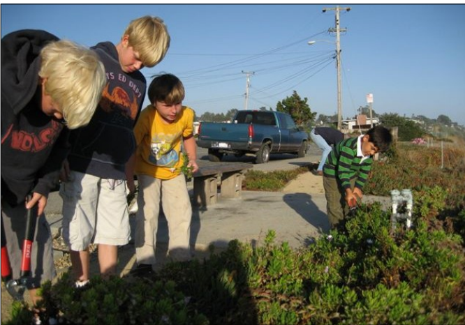
Helpful young volunteers! Note the concentration!

Maybe it was the beautiful summer evening or perhaps it was the tasty pizza that brought over 12 volunteers to the August Mini Park weeding party! With so many trimming, weeding, and mulching, our work was completed well before sunset. We really appreciate all your efforts and the garden looks great!