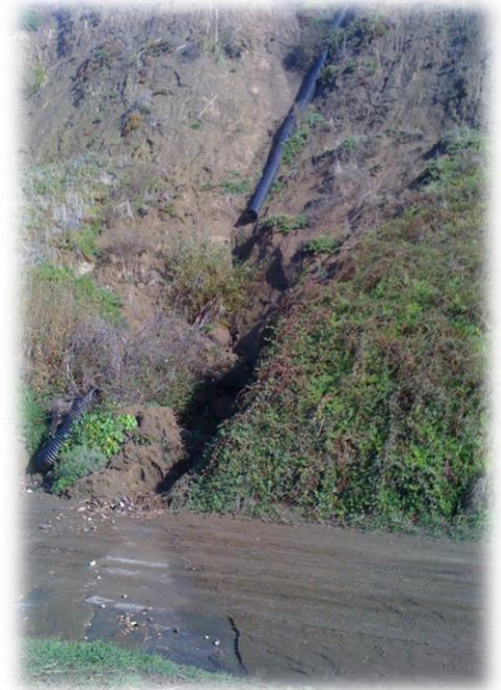
Storm Drain Damage in November 2011 The tube is now buried under eroded cliff face that has been scoured out from 2011 rains.