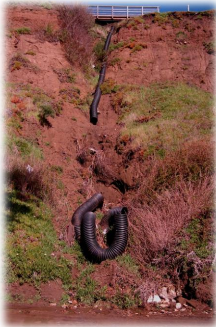
Storm Drain Damage in February 2010 The cliff is still relatively intact with the tube resting on top of the slide.