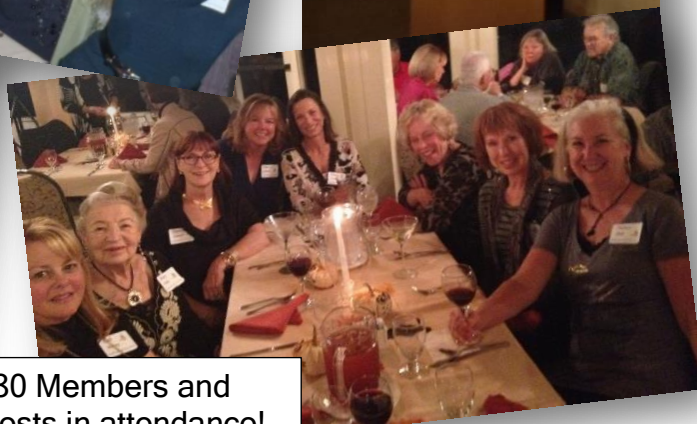
80 Members and Guests in attendance!