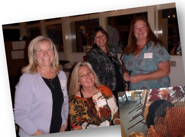
Thanks for joining us for our 2013 Annual Dinner!