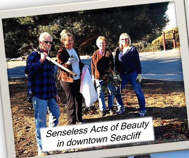
Senseless Acts of Beauty in downtown Seacliff