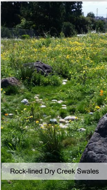
Rock-lined Dry Creek Swales

Our park is also an outdoor classroom. A stroll through the park reveals grasses, wildflowers, shrubs and trees that provide an on-going learning experience of Seacliff's native plant community. Plants thrive with little to no water because they have naturally adapted to the year-round moderate climate and the wet, summer fog. To lessen the impact of buildings and asphalt streets, we have learned to mimic features found in nature to slow down storm-water runoff, let it spread and slowly sink back into the ground. Porous pavement in walkways and the parking area allows water to seep into the soil, directing runoff to two rock-lined drainage "dry creek" swales. When it rains, about 50% of water flow can be slowed by vegetative bio-swales or rock-lined "dry creeks" that allow it to soak into the ground to nourish the plants and trees.