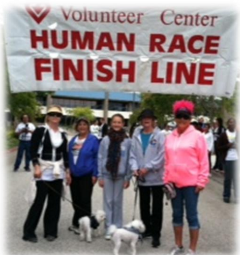
Go Team Seacliff!

The candidates then had the opportunity to meet and speak with the 125 residents who turned out to hear them. The association greatly appreciates those of you who attended the forum. This is the first time our associations have held a joint event and response to it was so positive that folks are looking forward to doing it again in the future.