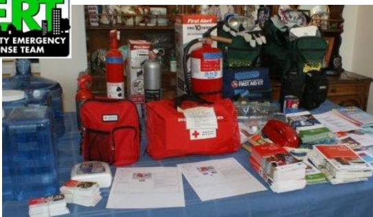
Are you prepared for the next disaster?

On display were samples of home disaster kits, various fire extinguishers, and a demonstration gas meter and electrical box provided by the Aptos Fire Department. Everyone was able to operate a fire extinguisher to put out a simulated small fire. Brochures providing information on disaster preparedness, fire and earthquake safety, and emergency services were provided by the Red Cross, FEMA, and the Aptos Fire Department.