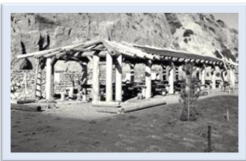
The Civilian Conservation Corps built our first Ramada in 1935!

If you want to help with the picnic - we need it! Volunteer and R.S.V.P. us by June 15 th at: info@seacliffimprovement.org