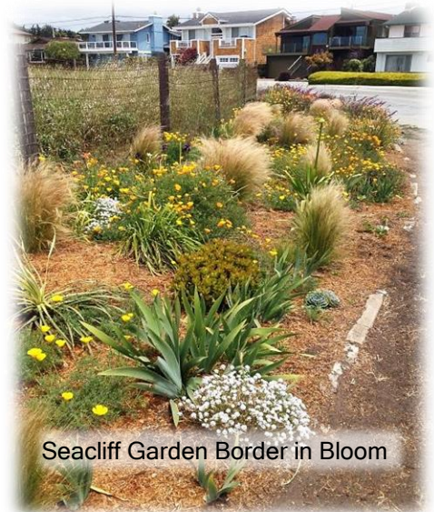
Seacliff Garden Border in Bloom

State Parks has also been busy pruning Seacliff State Beach shrubs and removing dead and potentially dangerous trees including: Eucalyptus safety pruning near visitor center, the removal of three dead trees near the kiosk, and removal of overgrowth near the ranger station creating a more open pathway for visitors. Thanks State Parks!