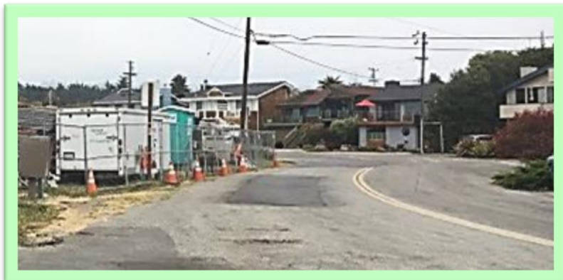
Slow for pedestrians near the construction staging area now located along Seacliff Drive near the bluff path.

Additionally, the utility boxes that need to be installed on State Park Drive in front of Sno-White Drive In were located in a flower bed that is being replaced by a retaining wall as part of the County streetscape project. It required both design and construction of the wall which took four months to complete by the County during the months when the County Public Works department was deluged with winter storm emergencies. Thankfully, construction has already begun and the sub contracted crew hopes to pour the wall this week. After it cures, utility boxes can be placed, another one-two week process.