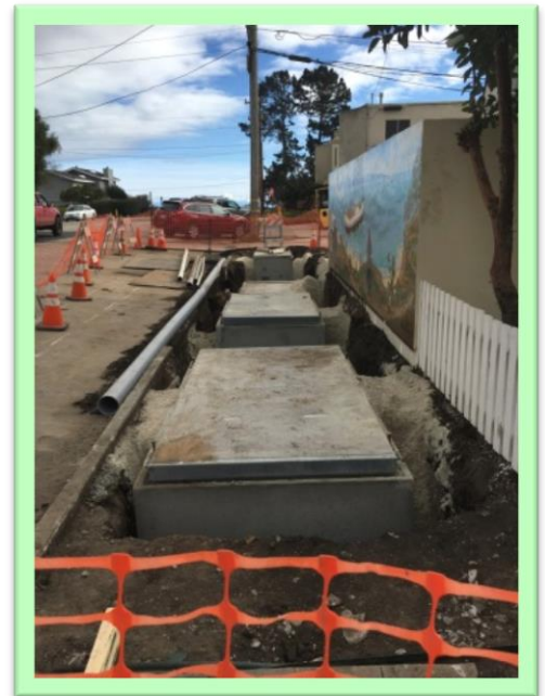
Construction of utility boxes required great care next to the Seacliff mural.