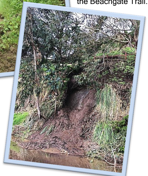
Winter storms caused multiple slides throughout the Beachgate Trail.