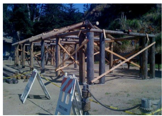
The new Ramada rises near the Visitor Center.

Seacliff State Beach is very excited about the Ramada re-construction project. We were fearful that it would be lost forever after it burned down several years ago. We were able to purchase the raw materials some time ago but were not successful in finding a contractor that could rebuild it with our available funding. State Parks was finally able to contract with a local builder and hopefully the Ramada will be finished and ready for events in the next several weeks.