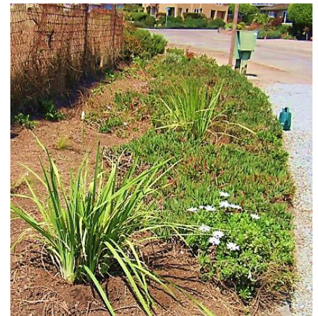
Butterfly Iris plants donated by Sylvia Qualls

Donations really help us maintain this area along a favorite local walking route. If you wish to donate plants to improve this highly visible spot, write to: info@seacliffimprovement.org and we will happily add your plant to the garden.