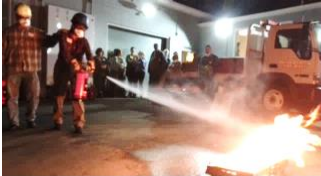
CERT fire suppression training

CERT Team Seacliff is grateful for Seacliff Community's generous donation of $ 1,124 through the Human Race. Funds purchased personal first aid packs for all members of Team Seacliff, as well as necessary medical equipment and supplies stored for planned use in the event of a disaster.