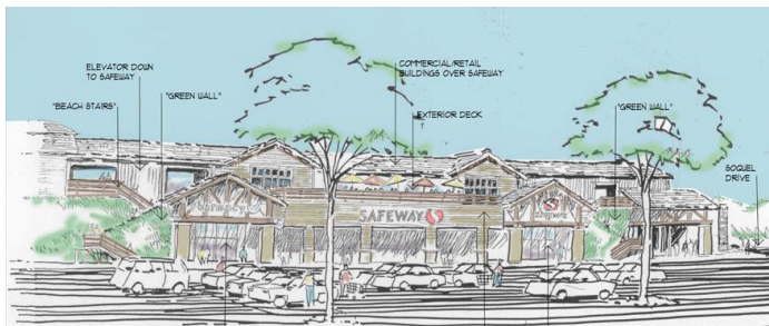
Rancho Del Mar Center Facing North

Meeting regularly with local businesses in the center, Safeway representatives and the Small Business Development Council at Cabrillo College that is acting as a liaison between the two parties, I have emphasized the need to preserve the mix of local businesses, provide a traffic plan that doesn't adversely impact an already impacted traffic area and environmental improvements to the complex.