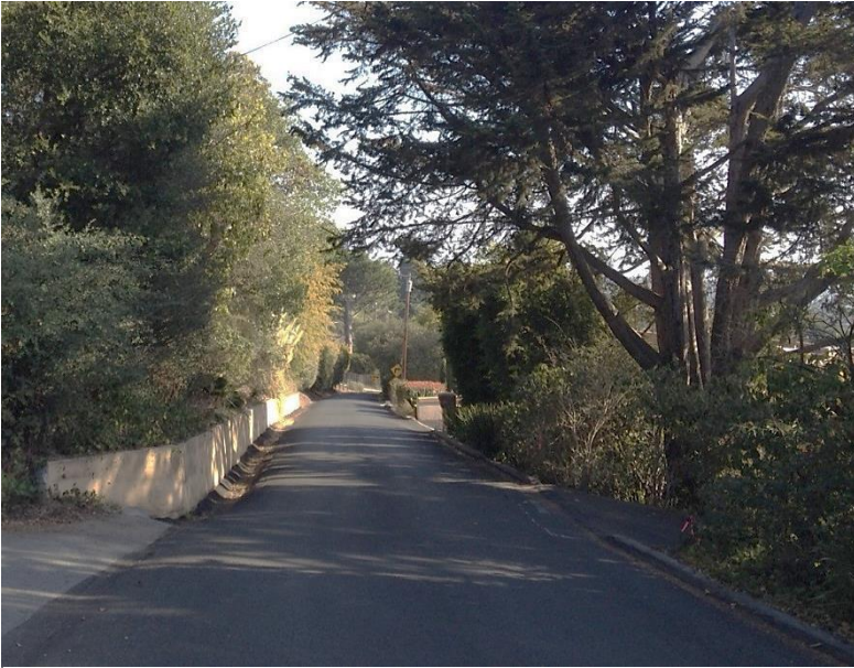
Neighbors up the hill on Viewpoint Road in Aptos formed a County Service Area and used their funds to repave the entire street.

Once a year, the CSA must hold a meeting to establish benefit assessment rates and a work program. Based on the property owners wishes, the Board of Supervisors then sets the rates and approves an annual budget for the CSA. The benefit assessments are collected on the regular property tax bill in December and April each year.