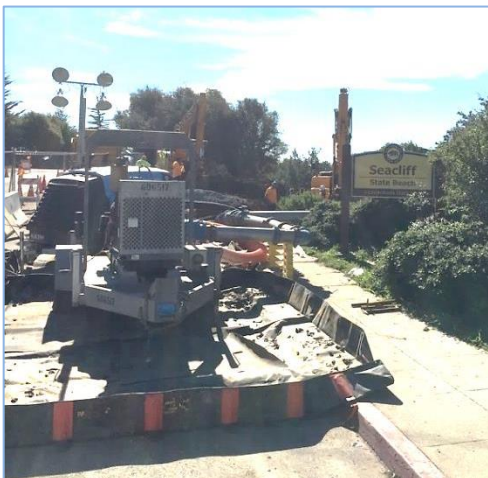
Repair to Seacliff State Beach storm drain is almost complete.

Recent storms have delayed the progress of construction but crews have continued to work when they can to complete the undergrounding of utility poles downtown. Repair equipment and activity at the entrance to Seacliff State Beach, from a failed storm drain, have complicated traffic flow so drive slowly