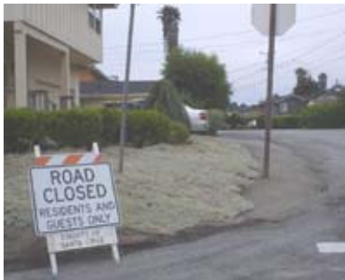
Road Closed signs were delivered by the county but never placed across area streets to block traffic.

dozens of beer bottles and other litter along the state park fence. The Mini Park maintained by the association fared a bit better with no sprinklers destroyed but most of the plants trampled upon with lots of beer bottles, fireworks and litter left behind for clean up by residents and volunteers. The association is following up with the County to determine the cause of this oversight so we can better address it next year. We'll keep you posted!