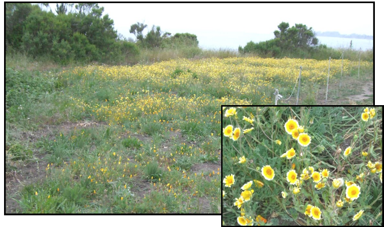
Seacliff State Beach Upper Bluff Test Plot overlooking Monterey Bay, May 2007, with blooms of tidy-tips and poppies among the native grasses and plants. Tidy-tips enlarged.

Stop by on one of your walks and take a look!