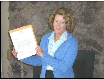
That's me with letter of grant award!

I'm proud to announce our recent grant award of $3,000.00 from Monterey Bay Aquarium's Conservation Action Fund for our Restoration of the Seacliff State Beach Park Upper Bluff to native grasses, wildflowers and plants!!! We are so grateful for this generous award!