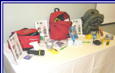
Various Emergency Kits

July General Membership Meeting: Persons of all ages, especially children, are invited to our next general membership meeting on Wednesday, July 23rd from 7pm to 9pm at the Seacliff Highlands Community Room! The focus will be on planning for our new county park in Seacliff. Please attend and contribute your ideas to our new park while munching on delicious cookies!