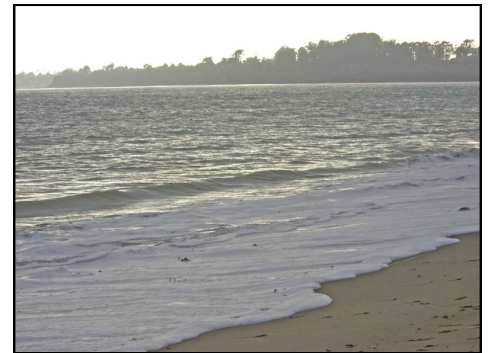
Our beautiful Seacliff Beach.