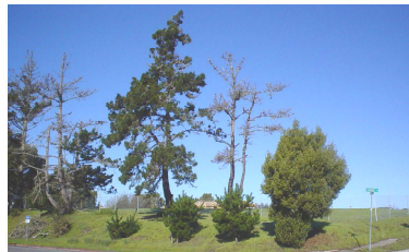
The proposed Seacliff Park site is located at Searidge Drive and MacGregor Road

The SIA, SNAP (Seacliff Needs A Park) and many Seacliff residents have been working for years to get a neighborhood park in Seacliff. While the State Beach and State Park are wonderful, they fill different needs than a neighborhood park with a play structure for children, picnic tables and grassy area to run, play or relax. Last Spring the voters of Seacliff were unable to reach the required two-thirds positive vote to tax themselves to buy the land and create a park. Although 62% of the voters were willing to pay $98 per year, that was 4% short of the needed vote. It did show, though, that most of the community wanted a park so much that they were willing to pay for it themselves.