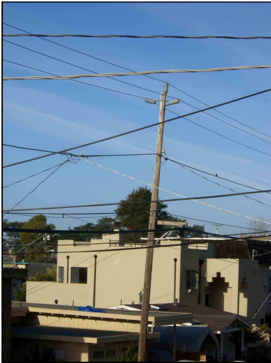
View of a Seacliff Neighbor.

I became chairman of the Seacliff Improvement Assoc. Utility Undergrounding Committee to find an answer to that question. A messy nest of phone and TV cable wires dangles across my bay view, so I'm motivated to move this process along.