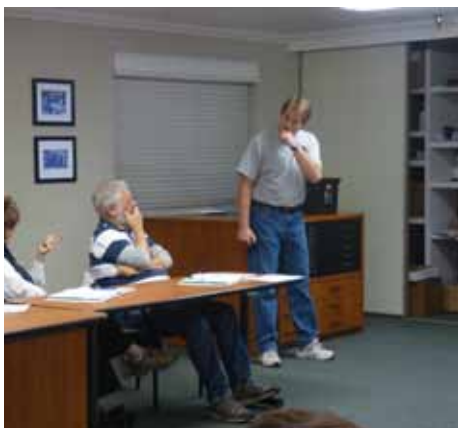
SIA members at CERT training class

We NEED YOUR HELP and we thank you in advance for your participation!! Please volunteer for site setup/teardown and sorting, pricing, displaying and/or selling by contacting Deb Murray at 662-9164 or via e-mail @ dmurray@megamind.org .