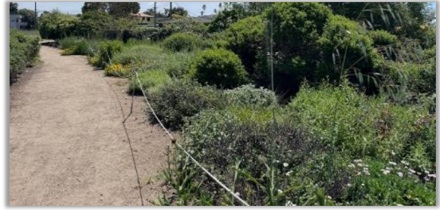
Native Garden along the Seacliff Bluff

The Seacliff Improvement Association's efforts to preserve an open accessible field and meadow adjacent to the upper parking lot at Seacliff State Beach began over 25 years ago. This effort grew out a community desire to preserve the bluff area